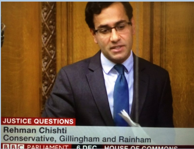
Rehman asked the Justice Minister what specific action is being taken to help tackle the specific issue of suicide in Prisons linked to Mental Health.