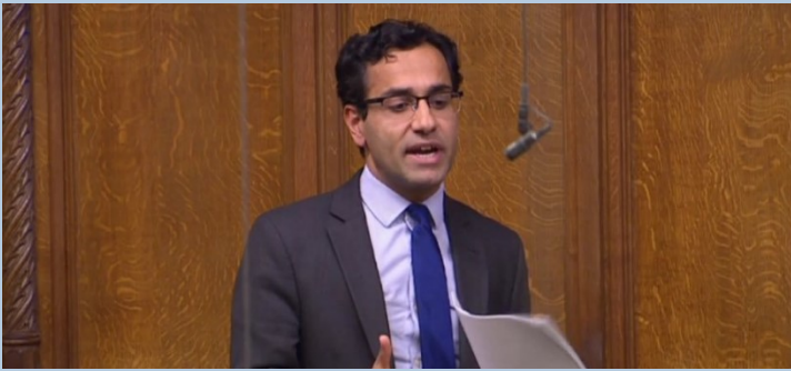
Rehman asked a question to the Prime Minister on EU Council meeting on Syria