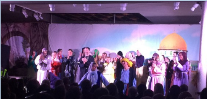
Rehman watched an amazing performance of the Christmas Nativity play at St Matthews Church, where the cast performed to a packed audience.