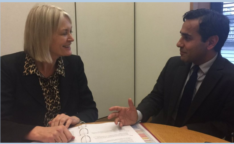
Rehman held a meeting with Business Minister Margot James on his Laser Pens Bill.