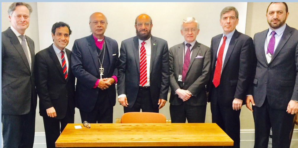
Rehman hosted the former Bishop of Rochester & the Pakistan Federal Minister for Interfaith for a talk on religious freedom and interfaith.