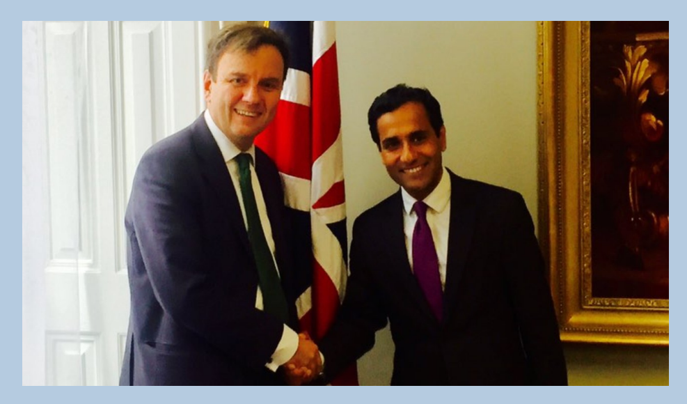
In his capacity as the new Government Trade Envoy to Pakistan, Rehman had a great meeting with Minister of State for Trade Greg Hands at the Foreign Office.