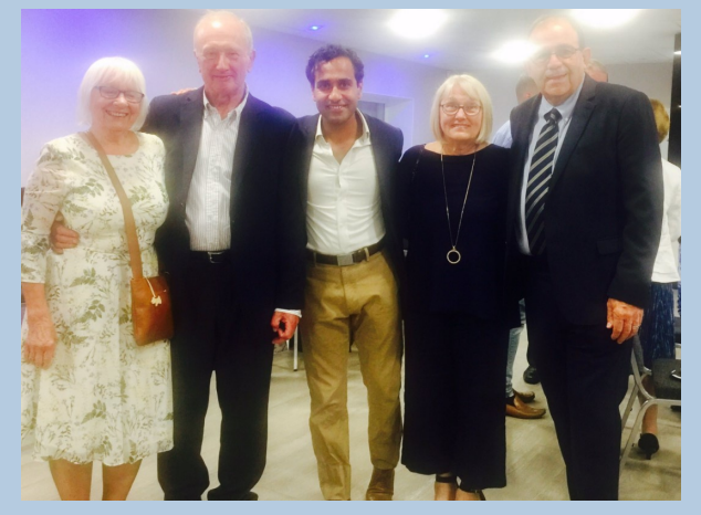
Rehman hosted Thank You drinks for wonderful local Gillingham & Rainham Conservative members and volunteers for helping him get reelected.

Following representations to the Government, Rehman was delighted that Medway Hospital secured an additional £1 Million for A&E winter funding.